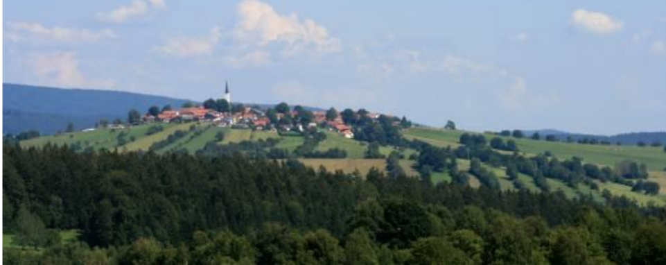
Figure 4. Kreuzberg, radial, horseshoe and band-shaped farms