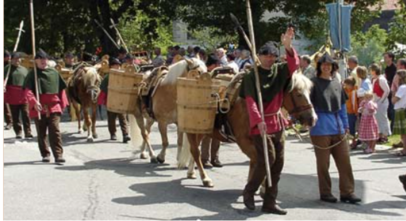
Figure 7. Folklore tradition, which recalls the transport of salt on donkeys