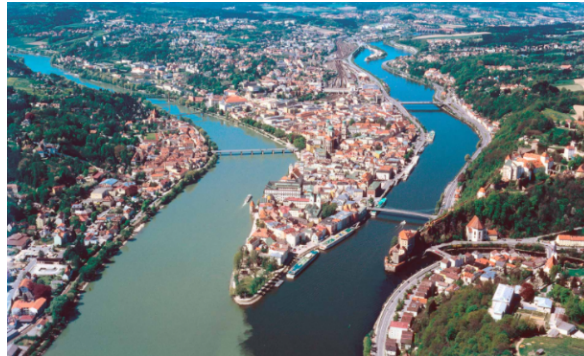
Figure 6. Passau, where the three rivers meet