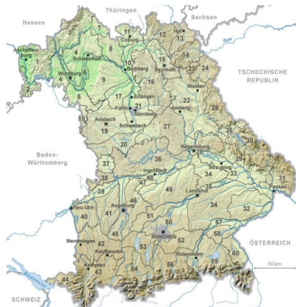
Figure 2. Division of the entire territory of Bavaria by cultural landscapes